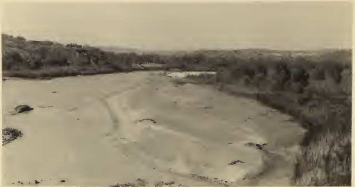
FIG. 1.—Canadian River near Boys Ranch, Oldham County.